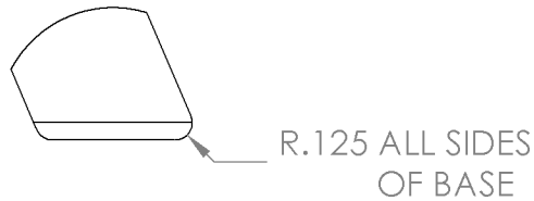
DETAIL A SCALE 2 : 3

*OUR HDPE IS A FULLY RECYCLED MATERIAL AND CAN BE FULLY RECYCLED.